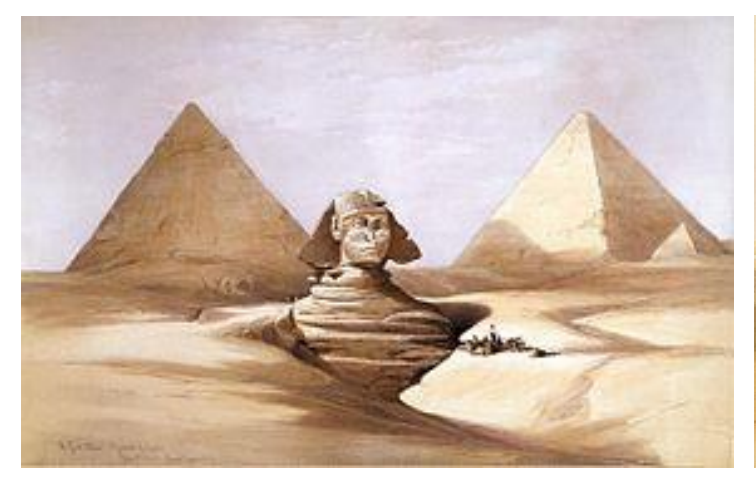
The Great Pyramids of Giza