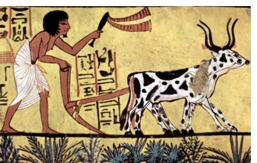
< Wall painting in Deir el Medineh

<u>Day 9 – Tuesday, February 14:</u> After breakfast, we visit the <u>temples of Karnak</u>, devoted to the deity Amon-Ra, a cult complex that is considered to be the largest ever built by any civilization. Then we start sailing up the Nile and enjoy magnificent scenery, featuring a dramatic contrast between the lush green shores and the desert in the distance!