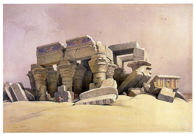
Ruins of the temples at Edfu and Kom Ombo, by David Roberts